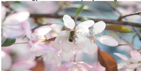
Honeybee on flowering fruit tree