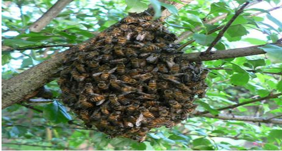
A honeybee colony in a natural forest in Ethiopia

APIMONDIA is the International Federation of Beekeepers' Associations. It aims to facilitate links between beekeepers, scientists and all involved with apiculture through the organization of international symposia and congresses.