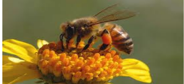
Honeybee collecting pollen

The Ethiopian Apiculture Board in collaboration with the APIMONDIA Secretariat and other apiculture sector stakeholders will organize the APIMONDIA symposium 2018 in Addis Ababa, Ethiopia. The symposium is the 2nd in its kind for Africa and the first in Ethiopia.