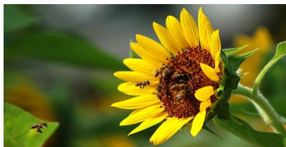
Honeybee on sunflower

As Ethiopia is good source of organic hive products, both producers and consumers of hive products will benefit from the development efforts and the sector improvements in Ethiopia. The strategic geographic position of the country makes it easy for participants of the Symposium to travel directly and easily to Ethiopia from all over the world. Addis Ababa being the main hub of one of the most successful airlines in the globe - Ethiopian Airlines -; availability of suitable conference facilities in Addis Ababa; the most admired hospitality of Ethiopians; current economic growth performance of the country and its political stability are other factors that make Ethiopia a natural host to the APIMONDIA Symposium. Participants will also have the opportunity to visit a country known to be an origin of the human race as well as Coffea arabica , some of the active and accessible volcanoes, as well as the historically rich rock hewn churches.