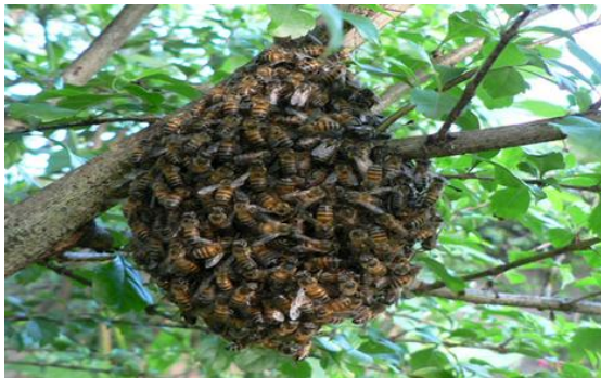
A honeybee colony in a natural forest in Ethiopia