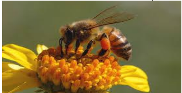
Honeybee in action

The Ethiopian Apiculture Board (EAB) in collaboration with the APIMONDIA and other apiculture sector stakeholders will organize the APIMONDIA Symposium 2018 in Addis Ababa, Ethiopia. The symposium is the 2nd in its kind for Africa and the first in Ethiopia.